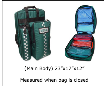
(Main Body) 23"x17"x12"

Professional quality first aid kit carefully designed to meet immediate Emergency requirements in Sports Care. Trauma Care Kit can be supplied with 2 different bag options. Both bags contain the same contents.